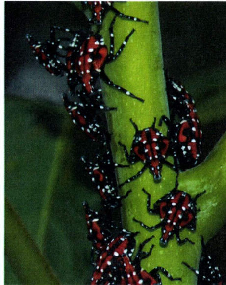
Older spotted lanternfly nymphs. Eric Day