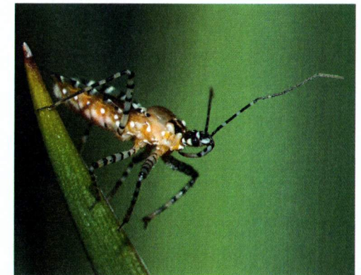
Assassin bug nymph.