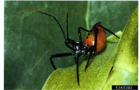
Wheel bug nymph.