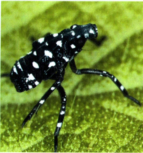
Young spotted lanternfly nymph. Berks Co. Conversation Dist.

Immature spotted lanternfly, Lycorma delicatula (White), are black with white spots when young. They turn red and black with white spots when older. A few other insects in Virginia have similar color patterns, but a close look will show that immature spotted lanternflies are easily recognizable. Sizes not to scale.