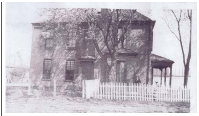
Manassas Jail, side view, ca. 1925