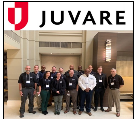
The NCR WebEOC Team